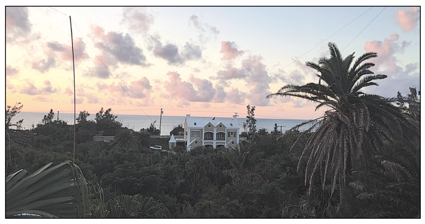
The sunset view from the shack is awesome.

are plenty of other restaurants scattered all around the island. But as far as I could tell, the pizza place is the only one that delivers.