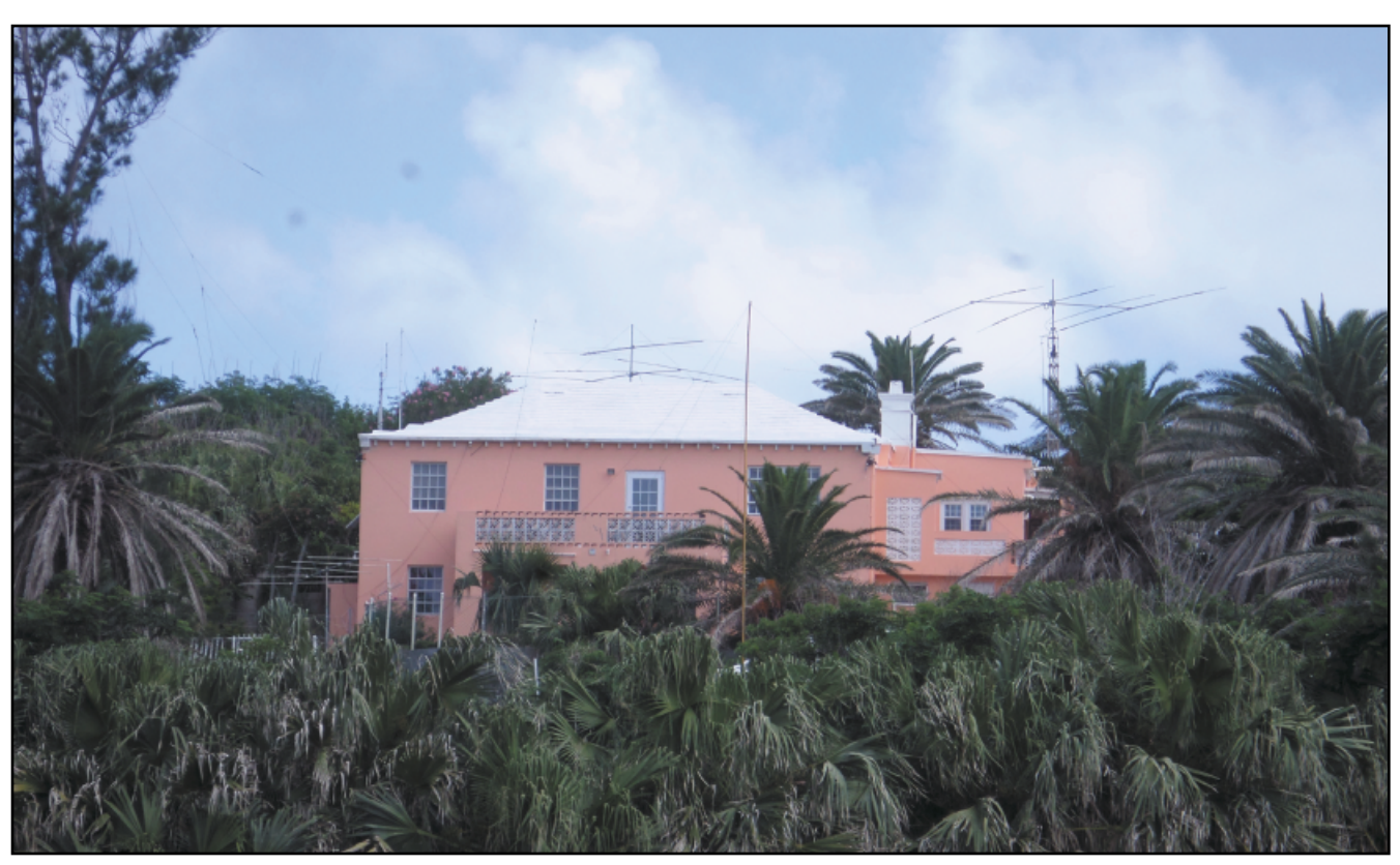
The VP9GE QTH.