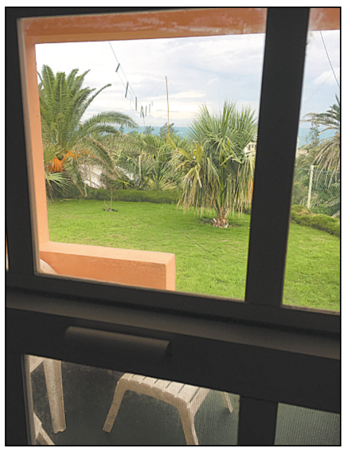
WARC Dipole used by N2OO/VP9. Not very high but it worked.

your operating permit (home license) and the dates and (Ed - VP9GE's) place of operation. U.S. hams: You can only get a VP9 license for a General Class and above U.S. license. Check with Ed about other countries' license requirements. Also note that the power limit for your license is strictly set at no more than 150 watts.